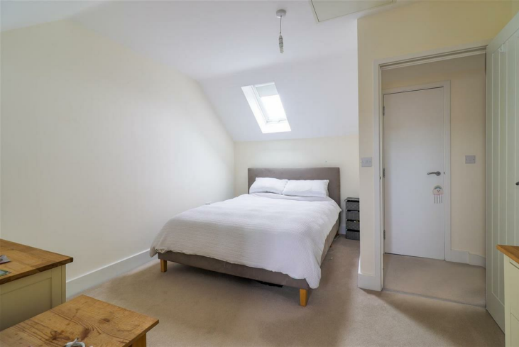
BEDROOM TWO 13'3" x 11'1" (4.05 x 3.4)