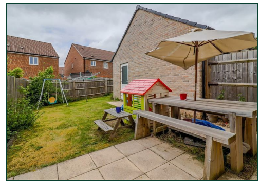
58 Dray Gardens, Buntingford, SG9 9GX